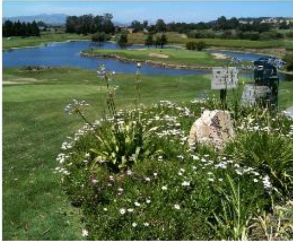
* Eagle Vines Golf Course, Napa *

Tuesday April 19th AND Wednesday April 20 th