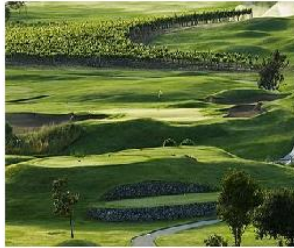
* Chardonnay Golf Course, Napa *

DAY 1 EAGLE VINES, 9:00 am Shotgun start, $ 85